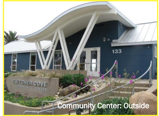
Community Center: Outside