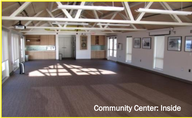
Community Center: Inside